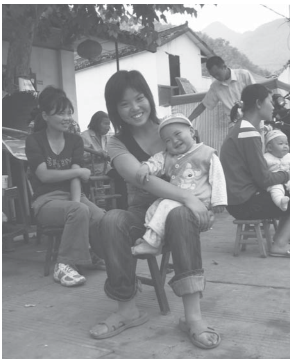
Women and children post-earthquake, Mianzhu County, Sichuan Province