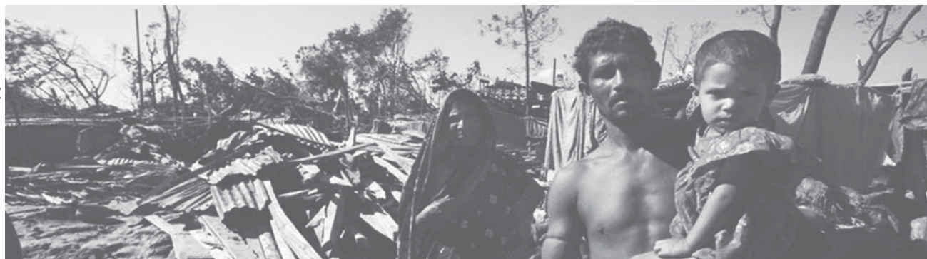
A family amidst the rubble after a cyclone in Bangladesh. At such times, gender and SRHR issues matter more than ever.

The Asia-Pacific is one of the most disaster-prone regions in the world. According to the World Disaster Report 2009 , 40.5% of global disasters between 1999 and 2008 occurred in Asia, and 84.5% of those affected during the same period lived in the region. While comparative statistics for the Pacific is low given these island nation's smaller sizes, 1 their fragile economies and other factors make them vulnerable to the impact of disasters. Most are also vulnerable to rising impacts of climate change. Given the scale of disasters in the Asia-Pacific region, it is extremely crucial that governments and other actors respect, promote and fulfil the sexual and reproductive health and rights (SRHR) of women, adolescents and people of diverse gender and sexual identities in disaster risk reduction, response and recovery (see Definitions, p.11).